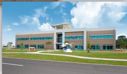
P-851 First Naval Construction Division Operations Control Design/Build LEED Platinum JEB Little Creek - Fort Story, Virginia Beach, VA