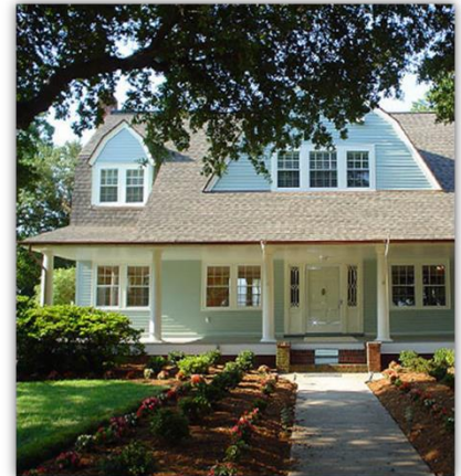
Historic Vermont House Exterior/Interior Renovations Naval Station Norfolk, VA