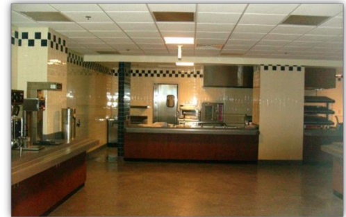
GSA Federal Building Cafeteria Interior Renovations Richmond, VA

"I wanted to pass on my congratulations for the outstanding OSHA inspection held at the P-851 job site. While OSHA does not use terms like "passed" or "outstanding" the fact the inspector found NO reportable offenses and issued NO citations is an outstanding testament to the entire Noah team. We appreciate your attention to detail. Well Done!"